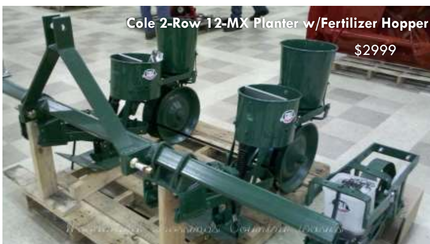
Cole 2-Row 12-MX Planter w/Fertilizer Hopper