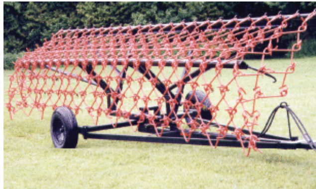
Model 2M (Swivel Harrow Caddy) Handles Harrow widths of 17' – 26'

Note: Drawbar is included with Harrow Caddies Deduct Drawbar price from Harrow to be used on the Caddy