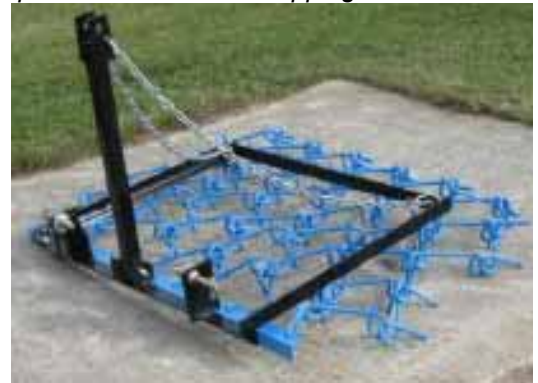
Optional 3 Point Carrier (Cat I) Shipping dimensions: L 41" W 10" H 16"