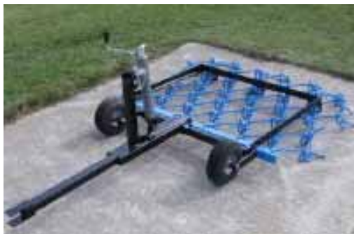
Optional Wheel Carrier frame Shipping dimensions: L 41" W 18" H 12"