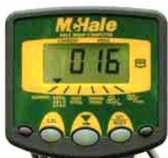
Programmable Bale Counter