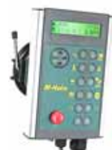
Electric Controls on 991BE