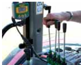
4 lever cable controls from the tractor seat