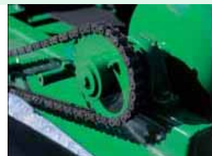
Shear bolt protection