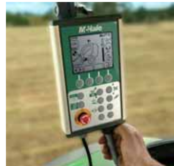
Expert Plus 3 Control Box