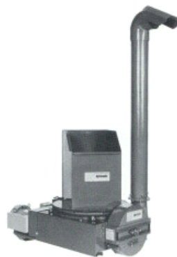
KB1365 With KB1425 Option